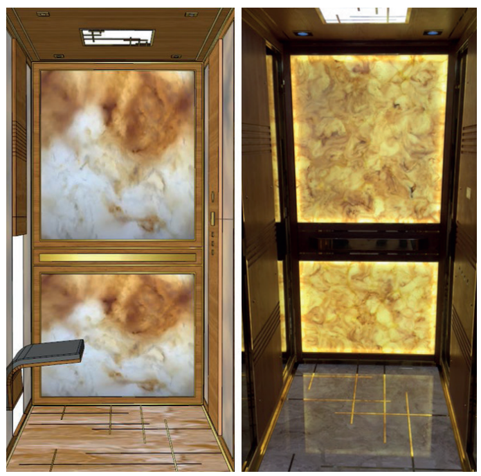
Concept of Lift Car Interior

Such specialist lift car finishes required dealing with outstanding suppliers and manufacturers in the Far East, with UK representative visits with HMY to ensure full compliance with the concept design. Special acrylics were sourced from China and impregnated with LED back lighting to produce this stunning effect for the rear wall.