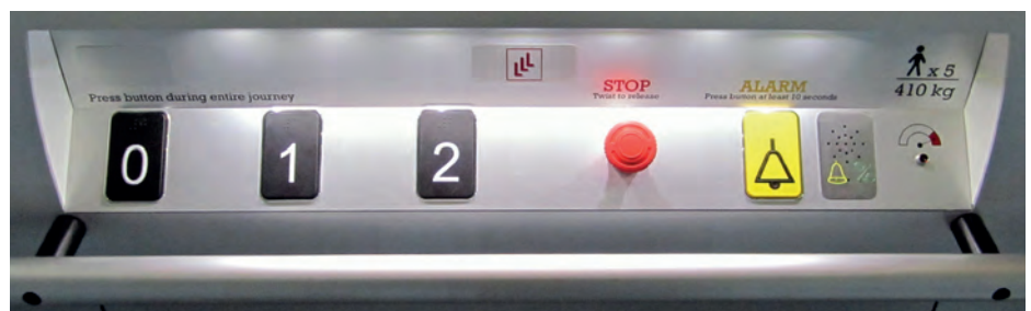
Superior 3 Platform Lift control panel